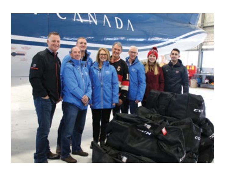
Donated hockey equipment was transported to northern communities on a scheduled flight aboard a NAV CANADA flight inspection aircraft.

Specifically, they asked us to use our expertise in integrating UAVs (drones) in Canadian airspace to manage the required airspace while they gathered data that might prevent such deaths in the future. We were more than happy to get involved. Weather permitting, every day in August, a UAV would fly from the Gaspé airport to track the whales' movement. Our role was to protect the airspace so that the UAV could safely and effectively carry out its mission, even when last-minute changes were required.