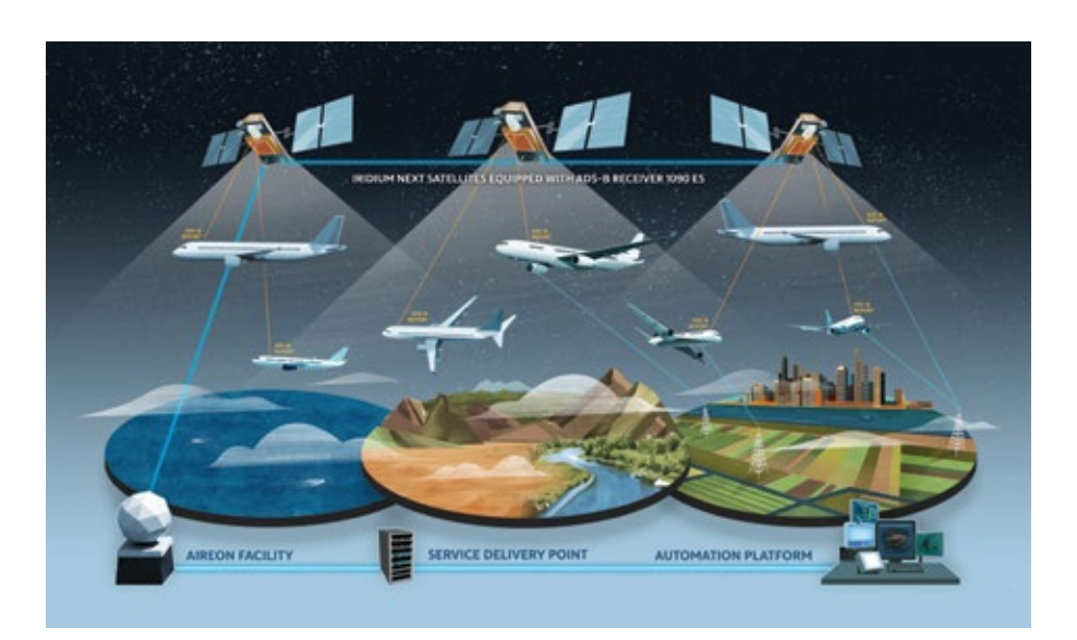
ADS-B information broadcast from aircraft will be received by Aireon's ADS-B hosted payloads on the Iridium NEXT satellite constellation. It is then relayed to air traffic control facilities in real time.

The Iridium NEXT satellites carrying the ADS-B payloads were sent into orbit in seven separate launches in 2017 and 2018. The last launch, scheduled for early 2019, will pave the way for Aireon to be fully operational in 2019. At that time, NAV CANADA will be set to be among the first in the world to use space-based ADS-B. We intend to use the new technology initially in the domestic airspace over the Edmonton and Gander FIRs, and then in joint operational trials over the North Atlantic with NATS in the UK.